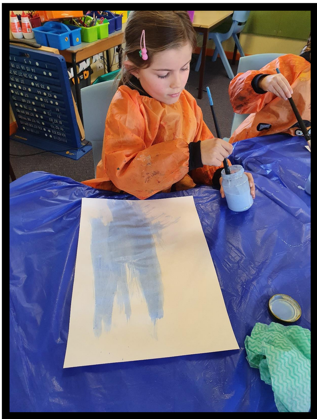
Painting “Winter in Germany” Winter in Deutschland. This is the beginning of a work in progress!