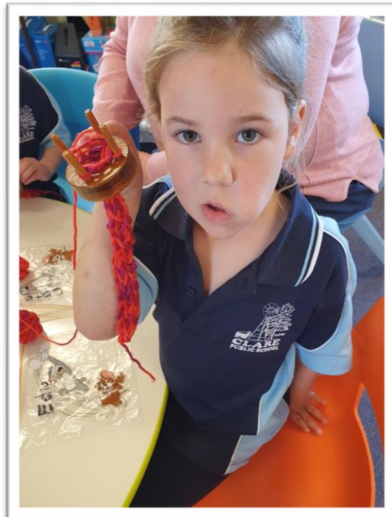
Kindy students are learning French Knitting! Senior Students are learning to knit with needles.