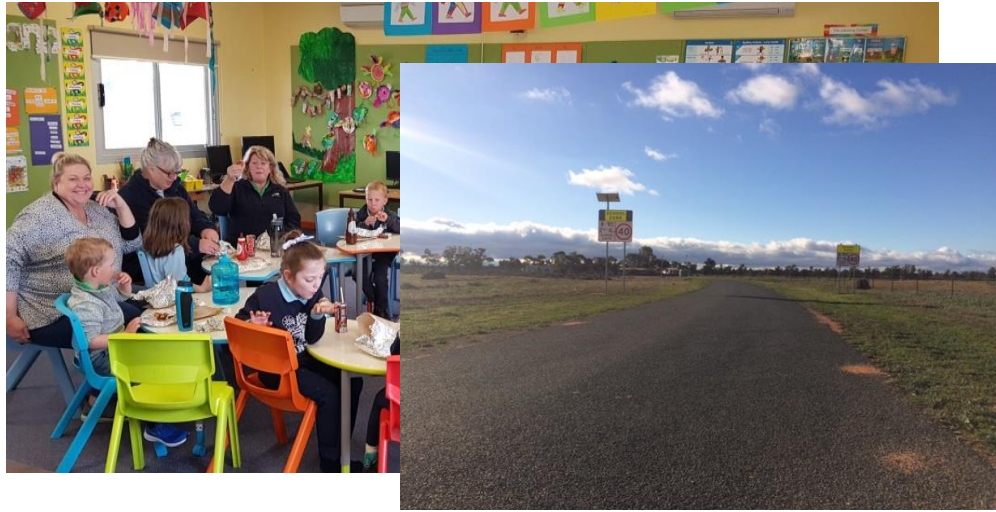
Streamlined library Clare's Culinary