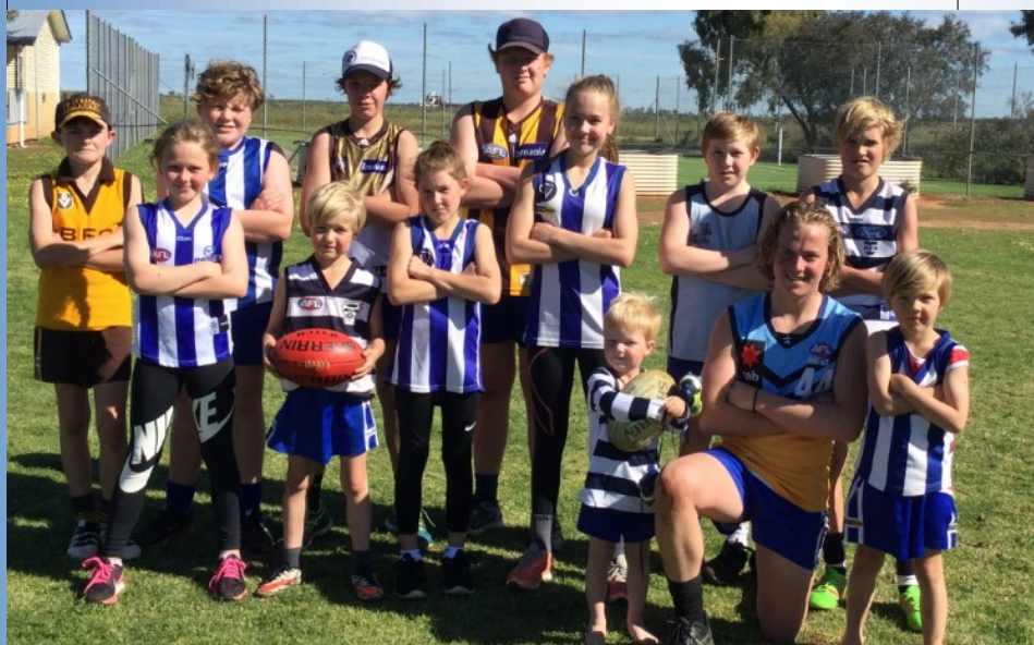
The kids team that took on the adults in the Footy Colours Day AFL match