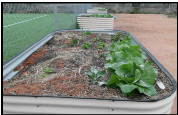
The vegie patches in new garden beds

We have our own garden beds and have harvested some vegies with the help of some water from the new rainwater tank. Thanks Mrs Scott for ordering the 4 new laptops and I-pads we think they are pretty great too.