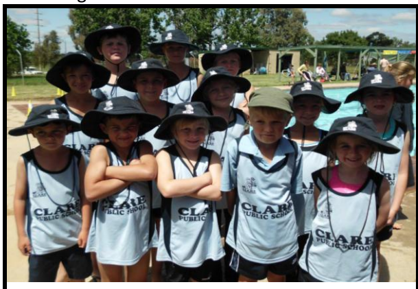
Small Schools Swimming Carnival at Moulamein

The students competed well at the small schools swimming carnival held at Moulamein.