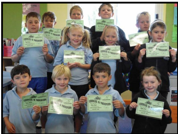
Intensive Swimming Awards

Intensive swimming lessons were provided during Term 1 at Dareton swimming pool with all students receiving swimming awards.