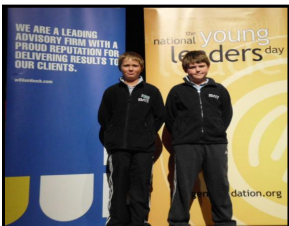
Melbourne Young Leaders Conference