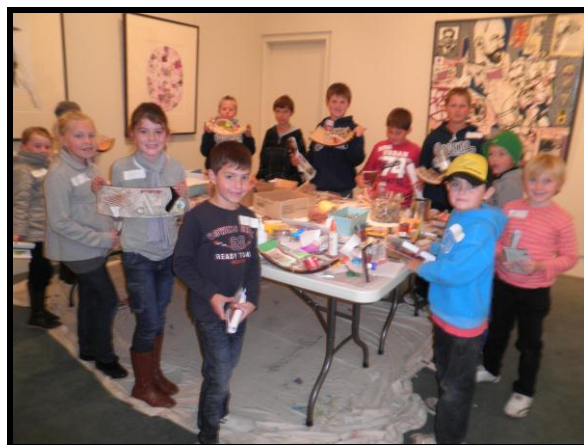
Sculptures made at the Geelong Art Gallery

Whilst we were on the school excursion the students visited the Geelong Art Gallery and participated in a workshop to make sculptures out of rubbish.