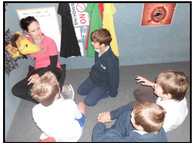
Healthy Harold's visit to Clare Public School