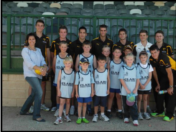
Hawthorn Football Clinic at Swan hill

football players with other schools in our district Balranald and Tooleybuc.