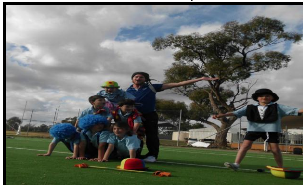
The Circus Challenge Performance

and performed in front of the parents to finish the day. The show was highly successful and fun was had by all.