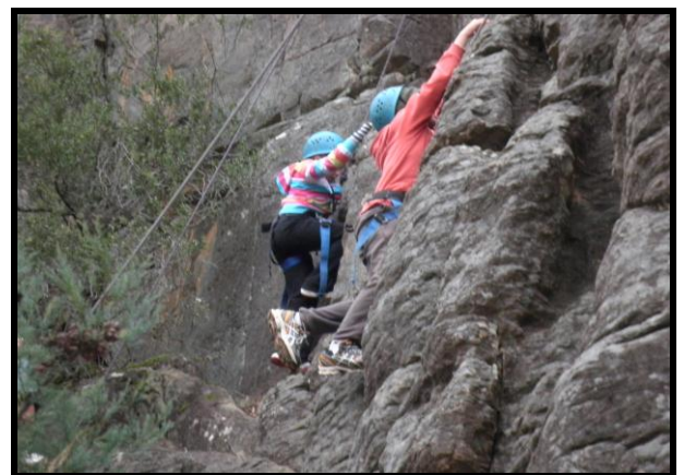
Rock climbing at the Grampians on excursion